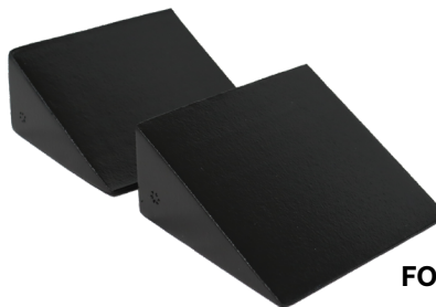
UTRT-1005 FOAM WEDGE (SET OF 2) 3.5"H X 7"W X 8"L