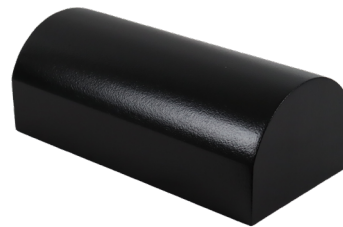
UTRT-1001 FOAM BOLSTER 6.6"H X 9"W X 18"L